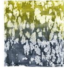
dreaming monotype 1/1 4" x 5"