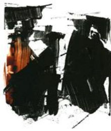
section 1.1 monotype 1/1 5" x 7"