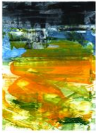
orange light monotype 1/1 4" x 6"